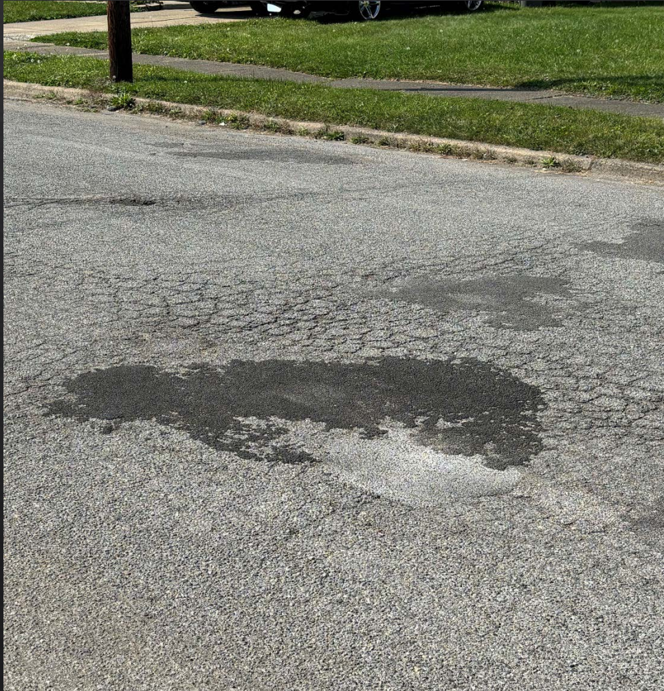
Filled pot holes on Lilburne Dr.