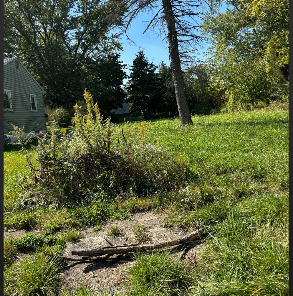
Grass Cutting on Vacant Lots.